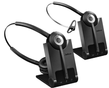
Left: Duo Version; Right: Mono Version